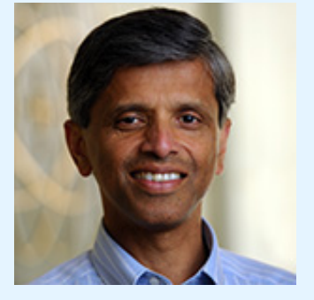
1) When did you realize you wanted to be a scientist, and what led you to choose physical chemistry?

I didn't decide to become a scientist until I finished my undergraduate education. I was exposed to research at that time which made me like chemistry much more. As to physical chemistry, I have always been fascinated with colors, particularly those in nature, like how flowers